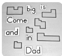
Word Match Game

The Strong Start Letters, Sounds and Words program is offered at our school and we need your help . Volunteer to be a child's coach for a minimum of 30 minutes a week for ten weeks. It's time well spent.